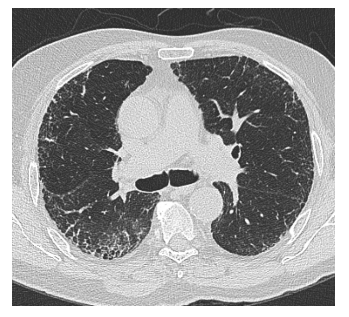
Figure 2. Lower zone: HRCT below the level of inferior pulmonary veins

Architectural distortion and close to hilum patterns patients did not have significant diffusion of CO differences between the low and high scores groups. Interstitial fibrosis pattern high score patients show reduced diffusion of CO suggesting lesser ability to gas exchange across the lungs<sup>[14-18]</sup>. Overall patients with high scores of traction bronchiectasis and